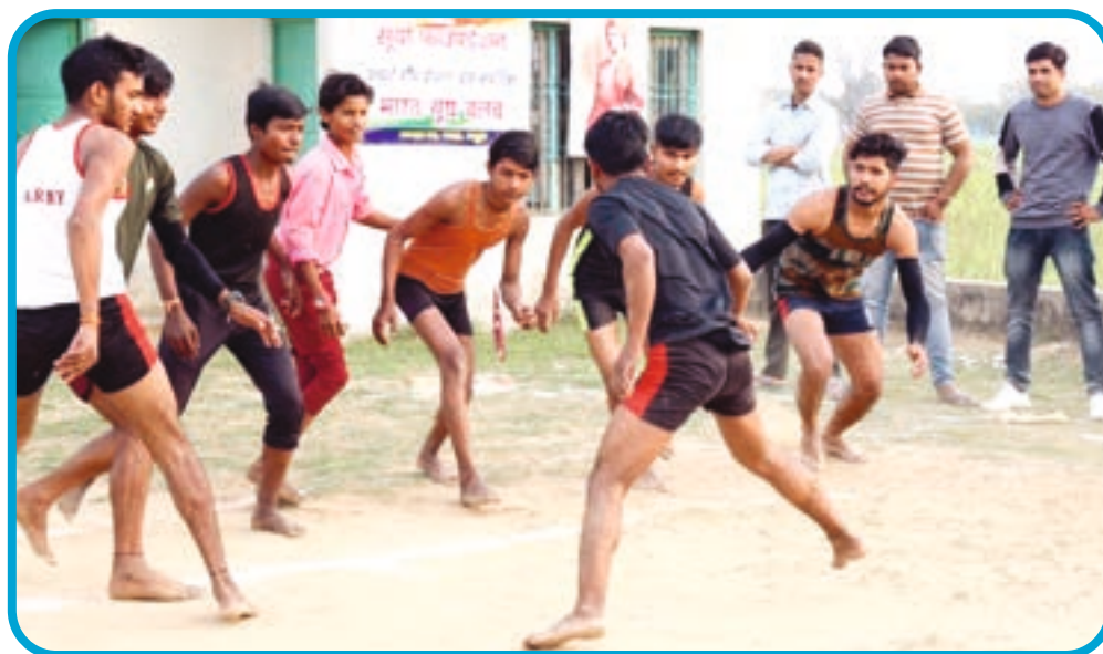
Surya Youth Club - Kabaddi