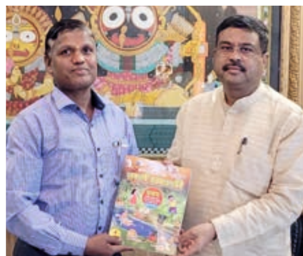
Surya Bharati Books presented to Education Minister Sh. Dharmendra Pradhan Ji