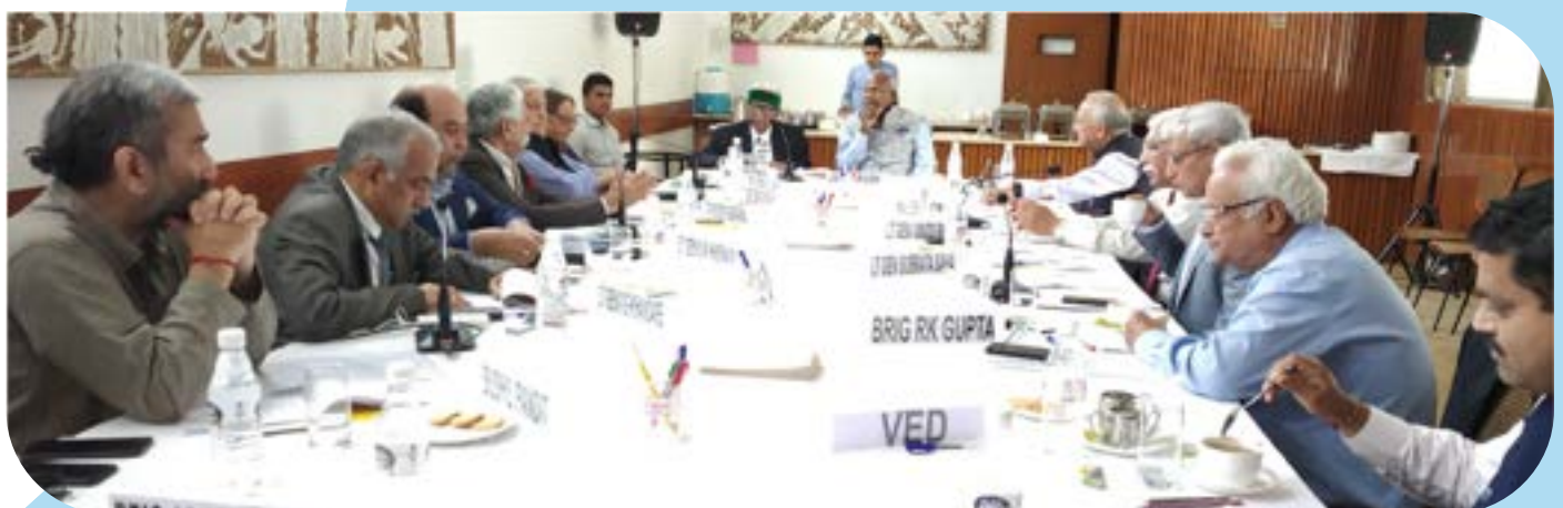
Think Tank on National Security