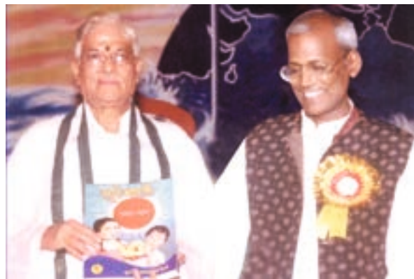
Releasing Surya Bharati Books by Dr. Murli Manohar Joshi, the then HRD Minister (2002)

Today we are seeing pleasant results of activities. Our efforts are being appreciated in government and non-government sectors - about 900 schools in Delhi, Haryana, Uttar Pradesh, Jharkhand, Uttarakhand and Rajasthan. We want to create an inclusive, accessible and interesting learning environment for all— children, teachers and parents.