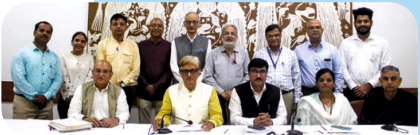
Think Tank on Livestock Management