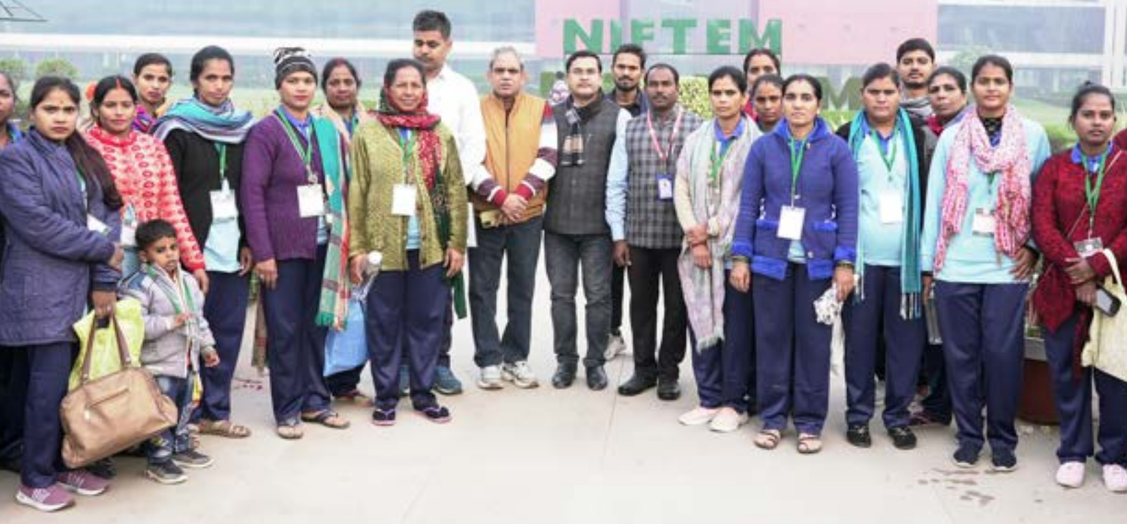
SHG Training Programme - a visit to National Institute of Food Technology Entrepreneurship and Management (NIFTEM), Sonipat (Haryana)