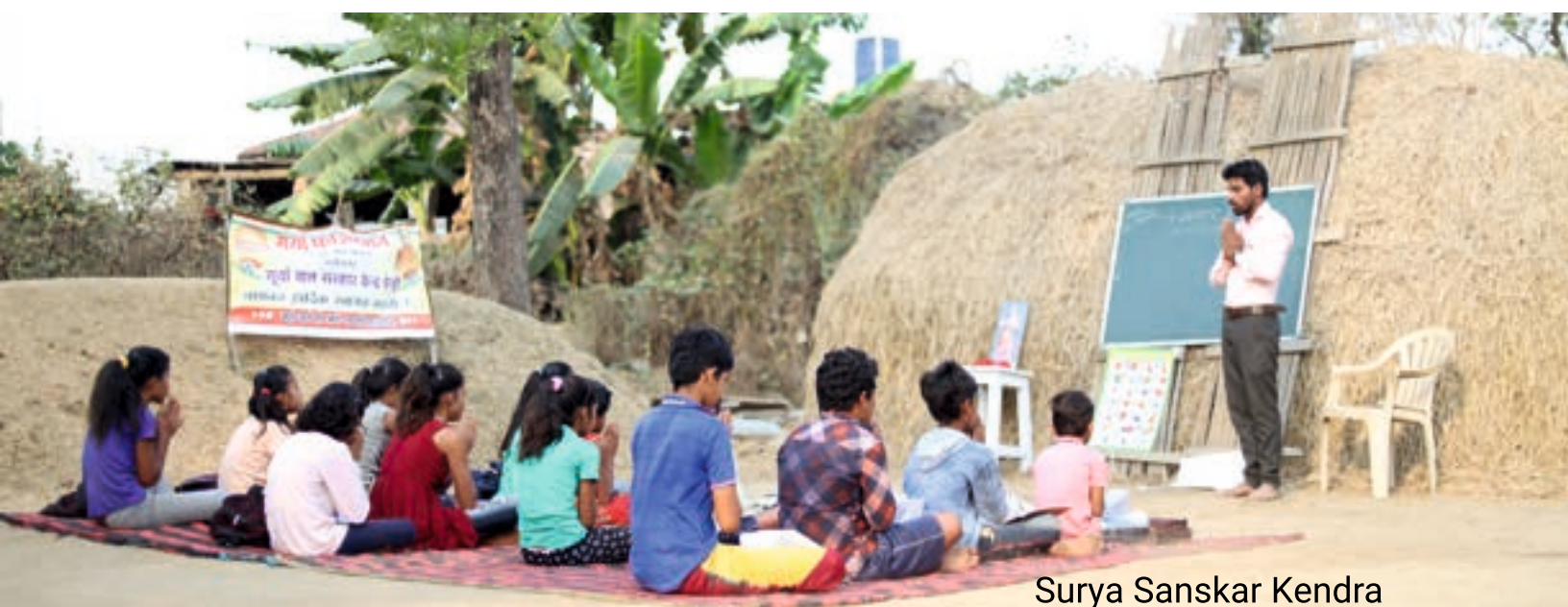
Surya Sanskar Kendra