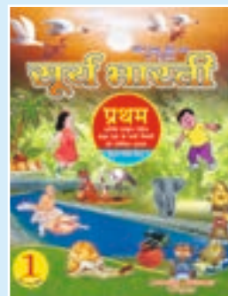
Surya Bharati Books

Bharatiya Education System focuses on the Panch Koshiya all-round development of the individual. It includes all aspects of learning and life while fulfilling duties towards self, family, society and the nation, making education inclusive and reducing the stress and burden of school goers. Heavy school bag is a problem.