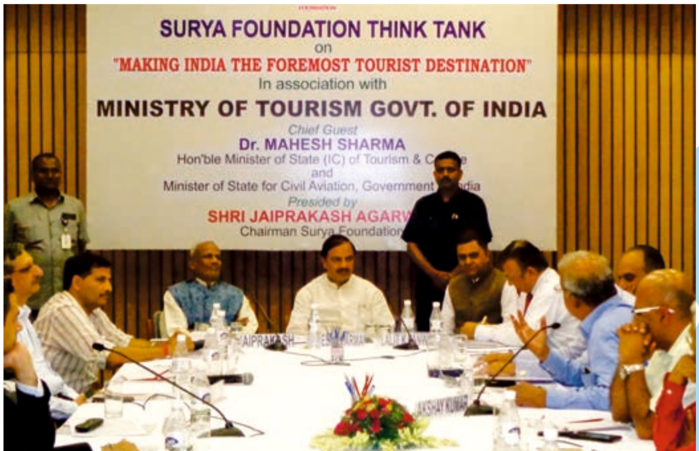
Think Tank on Tourism